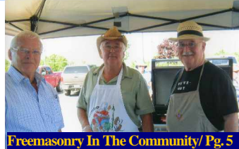
Freemasonry In The Community/ Pg. 5