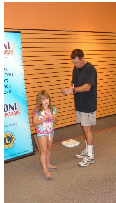
Dad and daughter registering