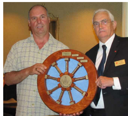
Sudbury Lodge receives the Journeyman's Award for most visits to other lodges