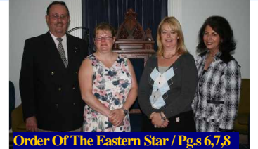
Order Of The Eastern Star / Pgs 6,7,8