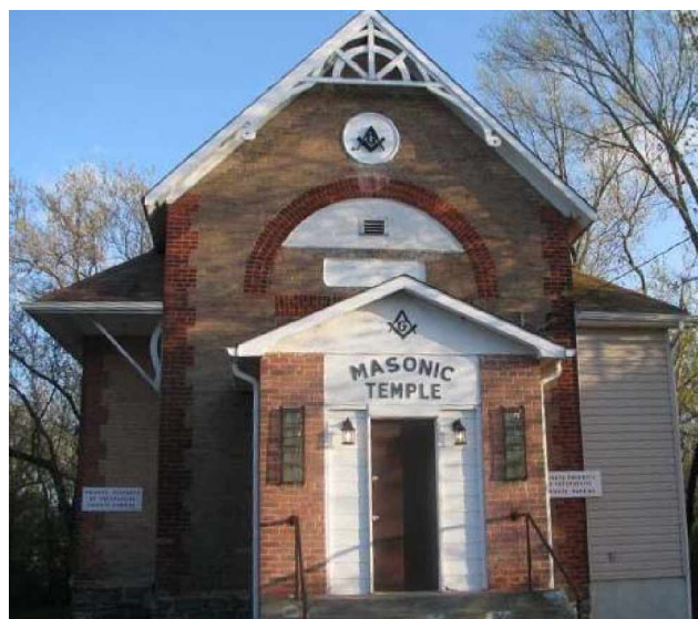
Sturgeon Falls Lodge No. 447