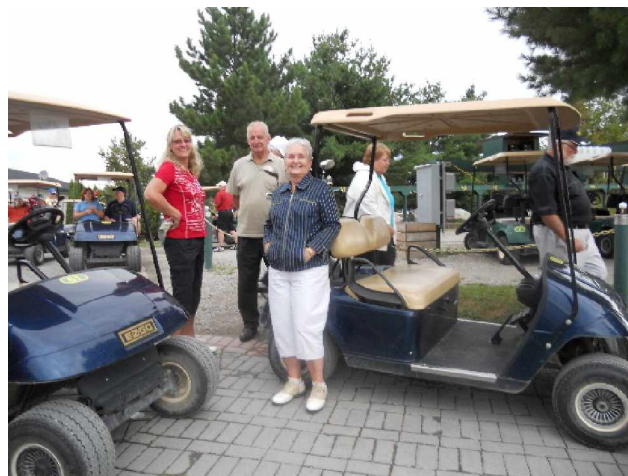
All set for the back nine