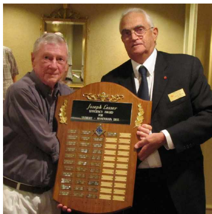
National Lodge receives the Joseph Lesser Efficiency Award