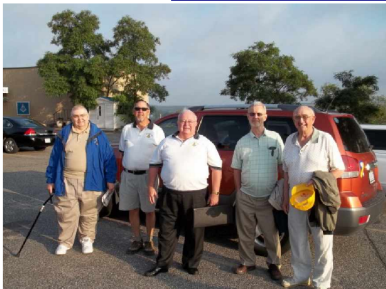
A beautiful day for a trip to Toronto