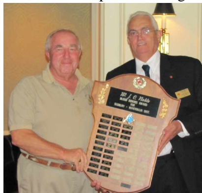
Doric Lodge receives the W.J.C. Noble Blood Donor Award