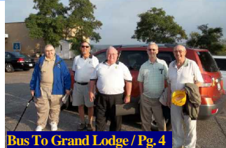
Bus To Grand Lodge /Pg. 4